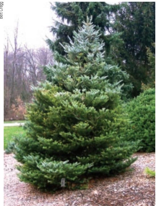
Abies koreana 'Silberlocke'

Subalpine fir is another example of a high elevation western species that does well in our Midwest climate. Our research has shown that it is relatively tolerant of soil pH compared to other firs. Moisture availability and soil drainage are probably the principle limiting factors for this interesting species.