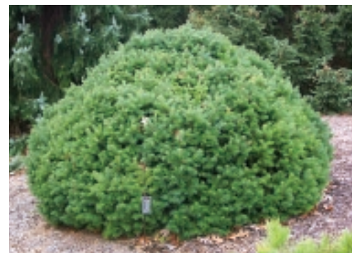
Abies lasiocarpa 'Green Globe'

Subalpine fir is another example of a high elevation western species that does well in our Midwest climate. Our research has shown that it is relatively tolerant of soil pH compared to other firs. Moisture availability and soil drainage are probably the principle limiting factors for this interesting species.