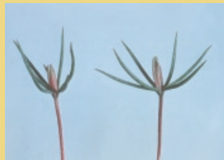
(Far left): Test, don't guess. Soil and tissue sampling are critical managing nutrition and diagnosing nutritional problems. Be sure to request pH along with any soil analysis. (Above left to right): Needle twisting induced by copper deficiency; Yellow tipping of conifer needles associated with magnesium deficiency; Phosphorus deficiency symptoms may include a purple cast to needles, often referred to as "purple heart."