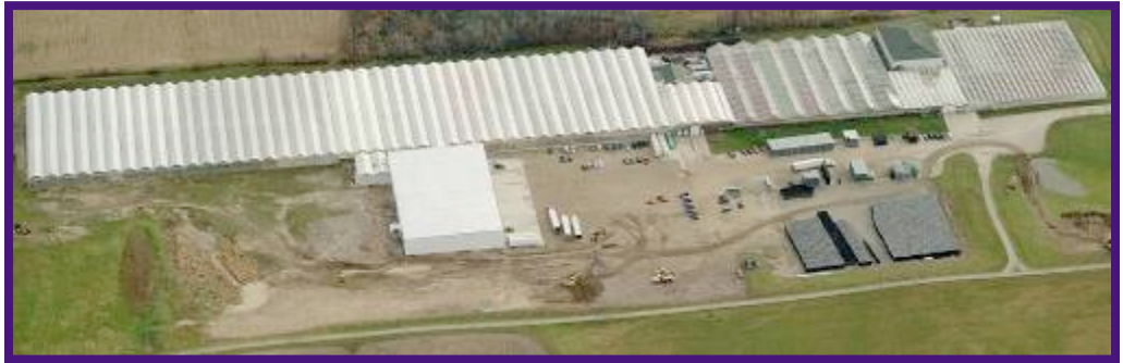
4525 Four Mile Road NW