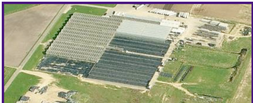
6564 Peach Ridge Avenue NW