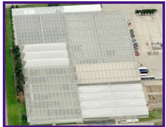
3525 Bristol NW