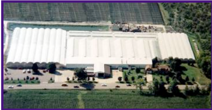
1780 Four Mile Road NW