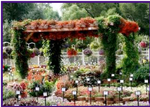
MYP Trial Gardens