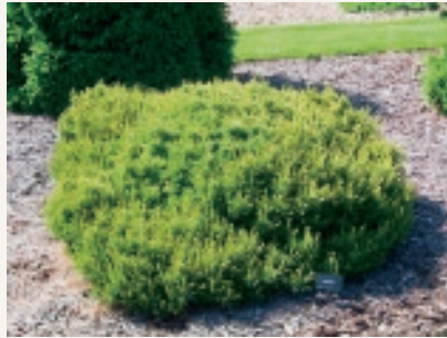
Pinus strobus 'Minuta', Dwarf white pine.

Pinus strobus 'Minuta'. Nice low mounding white pine with short needles. Prefers full sun.