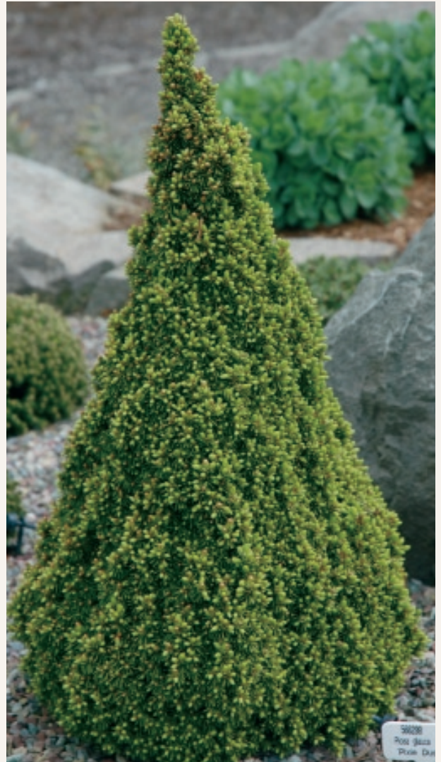
Picea glauca 'Pixie Dust', Pixie Dust white spruce